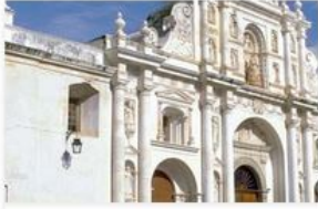
Antigua and Barbuda