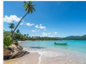
Central America and the Caribbean